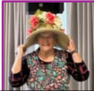
Governor Rita Cote asks "How does YOUR Garden Grow?"