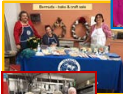
Bermuda - bake & craft sale