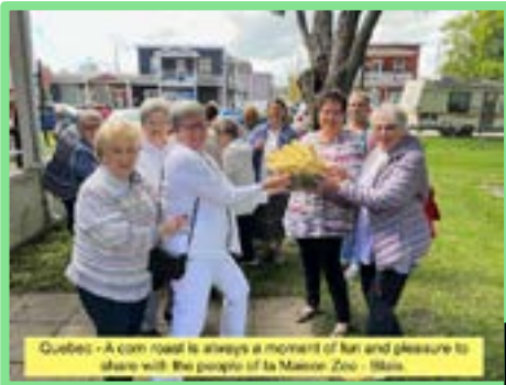
Quebec - A corn roast is always a moment of fun and pleasure to share with the people of la Maison Zoie - Iltis.