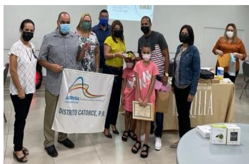
Donation of Luci lights to affected families in Humacao. Puerto Rico