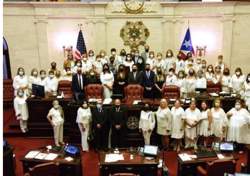
The theme of the campaigns was “Sowing seeds of peace”