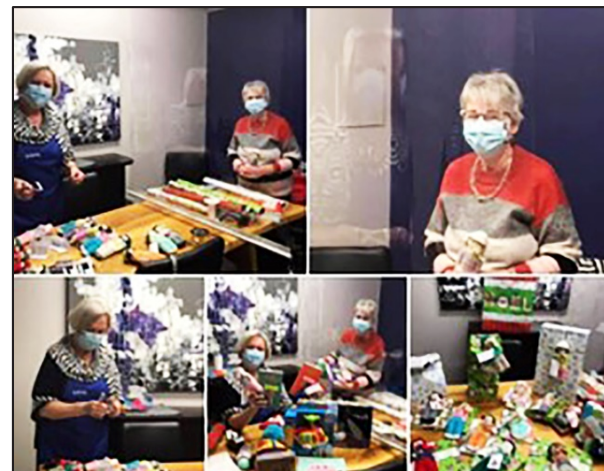
Members of the Québec Canada Club preparing book gifts for children's Christmas baskets. Project grant: Reaching Out to Women's Needs of La Maison Zoe-Blais

Click here for Club 21 Program guidelines and application