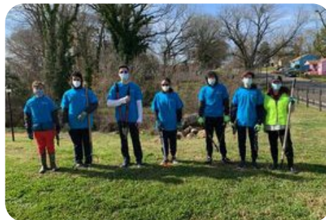
Charlotte, NC with their ASTRA Club remove 300lbs of trash at Stroud Park.