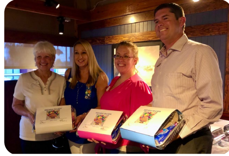
Orlando-Winter Park Club created 32 Birthday in Box kits for UCP students.