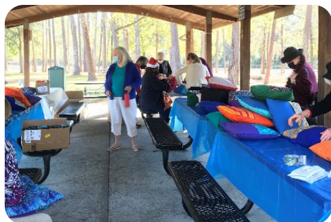
Gainesville, FL Club made reading pillows for 4 th grade at local school.