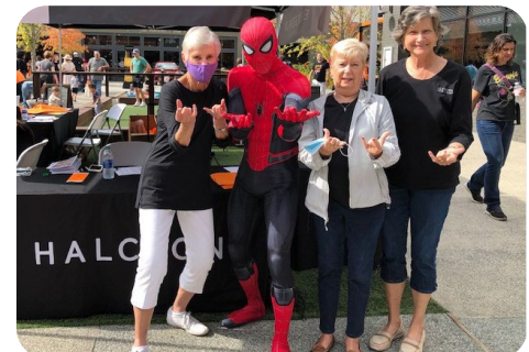
North Georgia, GA Club volunteers for Court Appointed Special Advocates