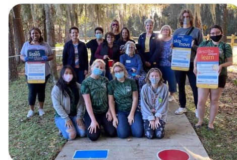
Ocala, FL Club painted and built a Born Learning Trail at Brick City Park.