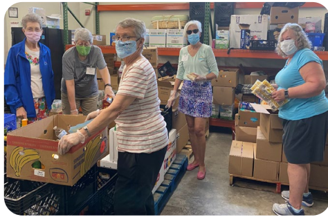
Raleigh NC Club sort and pack donated food for Urban Ministries Food Pantry.