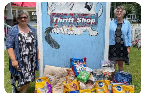
Statesboro, GA Club donates needed items to local Humane Society.