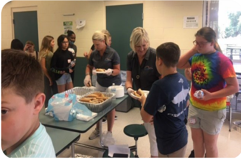
Lake City FL Club provides lunch to 120 students at the Richardson Academy.