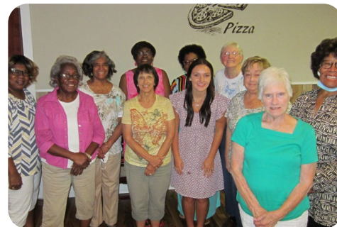
Gaffney, SC Club presents a scholarship to a deserving student.