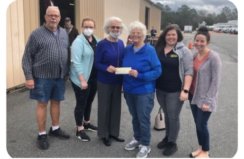
Starke, FL Club donates $1,000 to their local food pantry