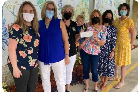
Lake County, FL Club funded Rimes Early Learning Center reading incentives.