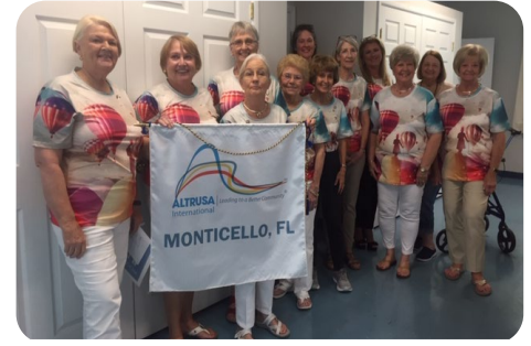
Monticello FL Club lifting lives in their community by funding Scholarships.