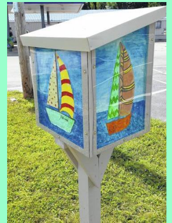
Highland County Little Free Library