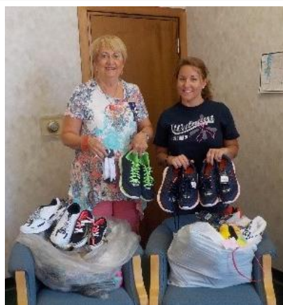
Branch County's Happy Feet Project