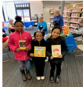
Hear a Book, Take a Book Greater Kansas City Club