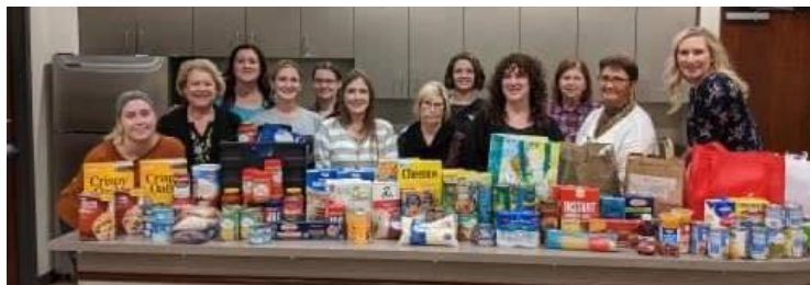
Northwest Arkansas Food Bank Washington County, AR Club