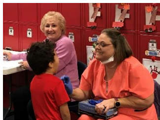
Dental Clinic Rogers, AR Club