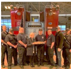
Cookies for Fire Depts. Sikeston, MO Club