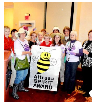
Springfield's Spelling Bee