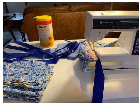
Completed masks from the Portland, Maine Club.