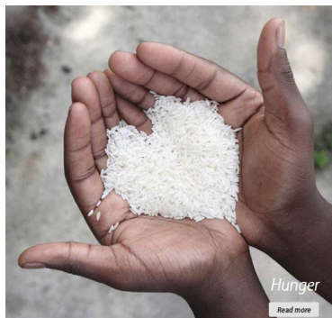
COVID-19 in California, District Eleven