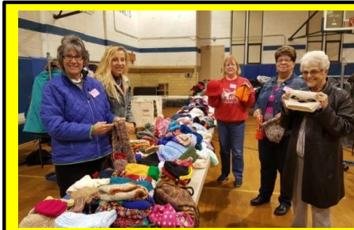
Battle Creek celebrated Make a Difference Day by working with Charitable Union to host a coat distribution.