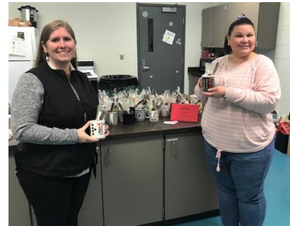
Mugs and Biscotti for Teachers Lawrence, KS Club