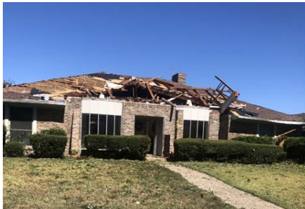
Tornadoes in Texas, District Nine