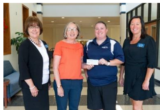
State Fair CC Adult Literacy Sedalia, MO Club