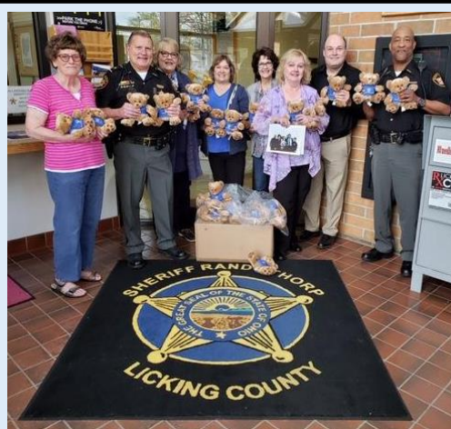
Licking County Love Me Bears