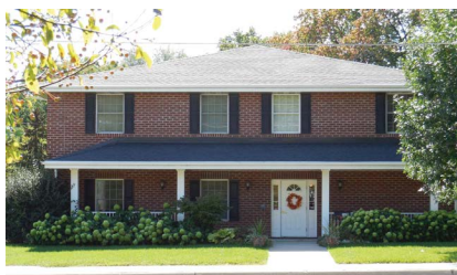
Altrusa House, Green Bay, Wisconsin