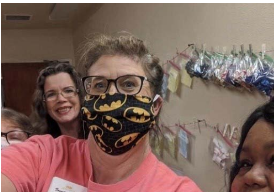
Members of the Tidewater Club wearing the masks they made.