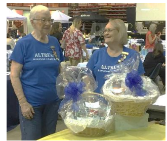
Women's Aware Conference Poplar Bluff, MO Club