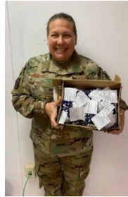
Pocket Service Flags Mexico, MO Club