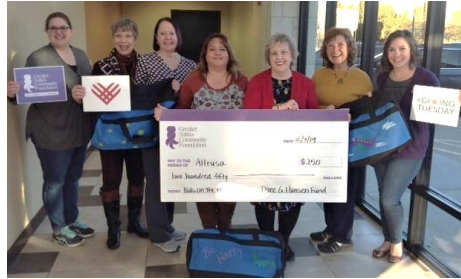
Sweet Cases for Foster Kids Salina, KS Club