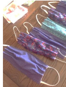
Handmade Masks Stillwater, OK Club