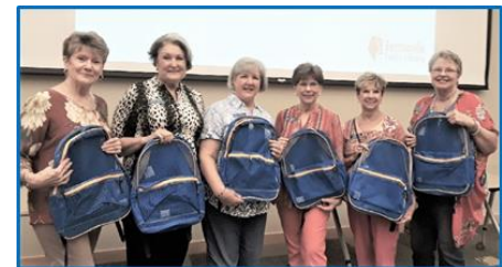
Backpack Distribution Bentonville/Bella Vista, AR Club