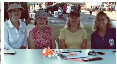
Senior Expo Registration Jonesboro, AR Club