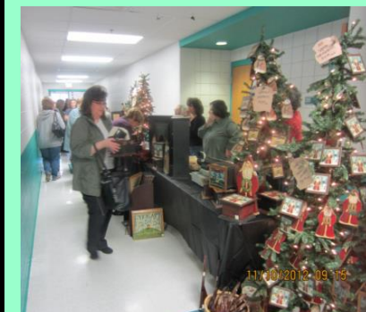
Chillicothe Christmas Bazaar