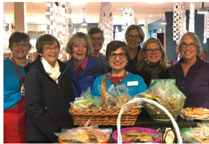
Columbus makes cookies for Ronald McDonald House