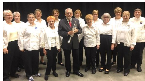
Symphony Guild Children's Concert Hot Springs Village, AR Club

District Eight - Dare to L.E.A.D. – Love, Empower, Assist, and Dignify