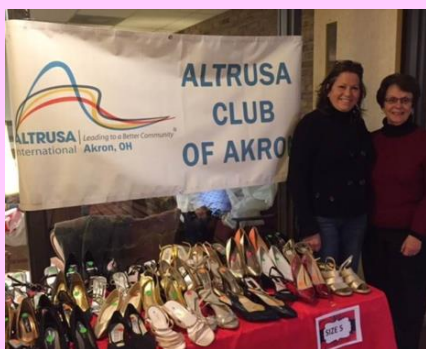
Akron's Prom dress give away.