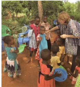
Kases for Kenya Fayetteville, AR Club