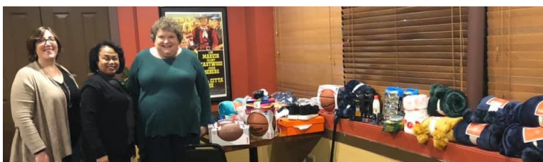
Hawthorn House Christmas Gifts St. Louis, MO Club