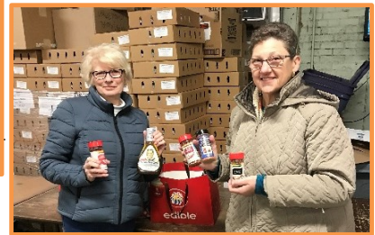
4 "Seasonings Greetings" delivery to the Food Pantry