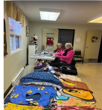
CHRISTMAS MARKET ZOÉ-BLAIS