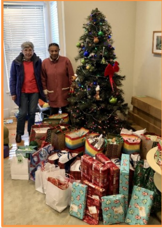
1. Blankets of Warmth and other goodies for the Lady Vets

December was a busy month! We delivered Blankets of Warmth and other gifts to the Lady Veterans at PFC Nicholas Madaras Home in Bridgeport, delivered ABC (Altrusa has Books in the Community) books to Amazing Grace Food Pantry for their clients to browse, pulled our 53 raffle winners, held a holiday dinner (collecting spices and condiments) and delivered our 'Seasonings Greetings' to the Amazing Grace Food Pantry