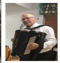
CHRISTMAS PARTY FOR 31 ELDERLY

Since January looks colder, the club has bought mittens for the