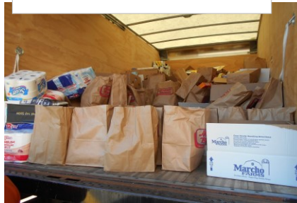
The Pantry Truck is filling up quickly.