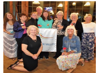
Members of the Altrusa Club of Merrimack Valley