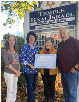
Pictured are members from Temple B'Nai Israel of Laconia delivering the proceeds check to Altrusa members.