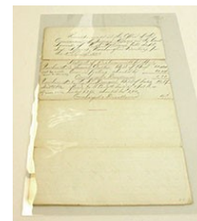
A document in polyester sleeve

Decide on how you want to store the materials, and which storage supplies or formats work best for your club.