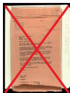
Image of what not to do. Items are hanging outside the folder resulting in creased and crumpled edges