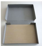
Box with folders that fit exactly inside.

The old school method is archival boxes, folders, and tissue paper. Bear in mind that these are still best for scrapbooks, flags, non-digital photographs, and memorabilia.