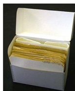
Document box with spacer boards