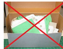
What not to do: papers are bent and folded to fit inside the box.