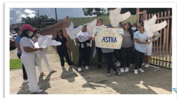
Peace Day Activity