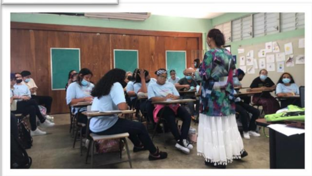
Astra members are receiving orientation about bullying.