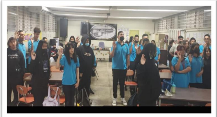
Initiation & Installation Ceremony of José' Campeche Hi School