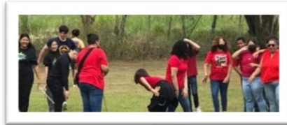
Group of students to be chartered as a new ASTRA Club, sponsored by Altrusa International of Cabo Rojo, P.R., Inc.

It was an excellent activity of great benefit to the youth. Under the motto "ASTRA raising your quality of life," they participate in workshops, dynamics, a Talent show, and Goofy Games for the knowledge and enjoyment of all. From their evaluations, it was the same great happiness and pleasure for all.