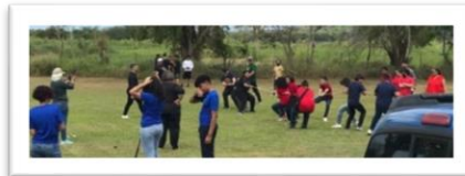
Group of students to be chartered as a new ASTRA Club, sponsored by Altrusa International of San Germán, P.R. Corp. are seen participating in the Goofy Games.