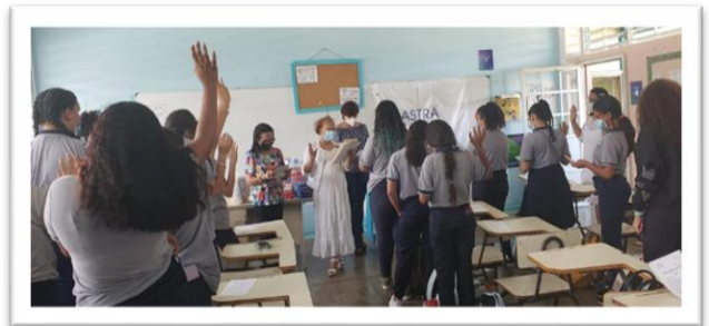
Initiation & Installation Ceremony of Generoso Morales School