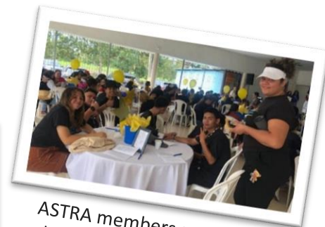
ASTRA members sponsored by Altrusa International of San Lorenzo, P.R., Inc.