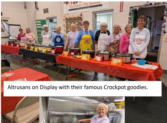
Altrusans on Display with their famous Crockpot goodies.

All proceeds went entirely to Project FEED and were presented with a check for $1824 at our November 19 meeting.