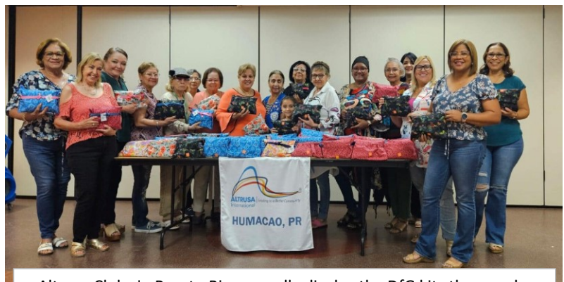
Altrusa Clubs in Puerto Rico proudly display the DfG kits they made.