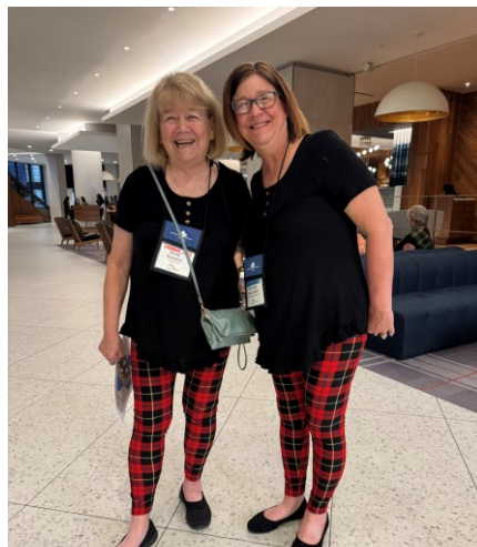
Altrusans from Ohio. Great Tartan tights.