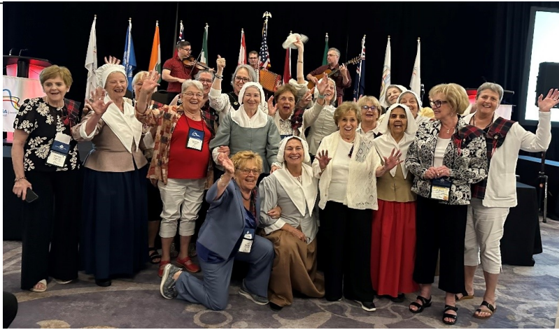
Photo taken below of Les Filles du Roy with members of the Quebec City Club.

'A la Rencontre des Filles du Roy translated "Meeting the King's Daughters". They were dressed in the time period of 1663 - 1673 and each portrayed a story of a woman's desire to travel across the ocean to start a new life in New France.