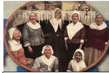
Les Choeur des Filles du Roy