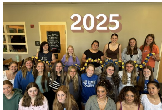
Look at our ASTRA club now!! More than 50 links in our Chain of Service.