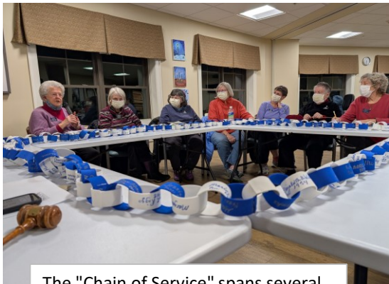
The "Chain of Service" spans several tables here at our Business meeting.

The draft will be presented to the board and then presented to the club. Approval of the budget requires a vote by the club.