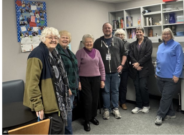
The 2025 Cookie Walk Team