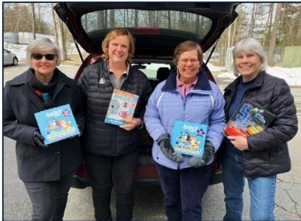
Altrusa of the Seacoast