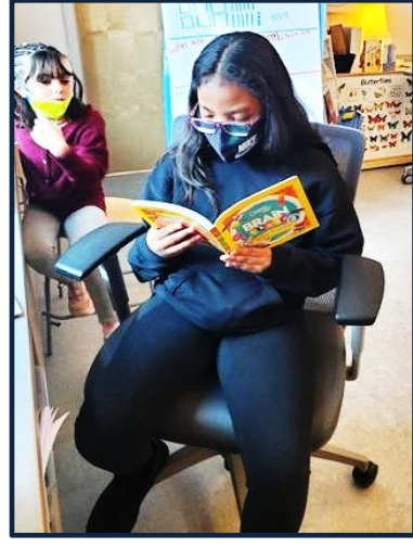
Readers from the 3rd grade at Rowe Elementary enjoying the books we delivered.