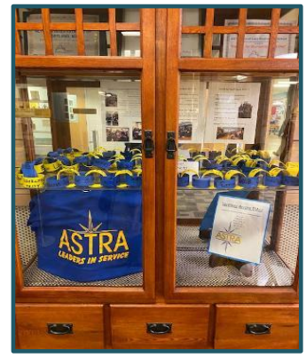
Right: ASTRA T-shirt and "Chain of Service" on display in the main lobby of Lake Region High School.

Our first meeting of the month (March 3rd) was cancelled by the snow storm which prompted a 2 hour delay in the start of school that day. Since we meet during 'Laker Time' (7:30 - 8:05 AM) there is no make-up for that period.