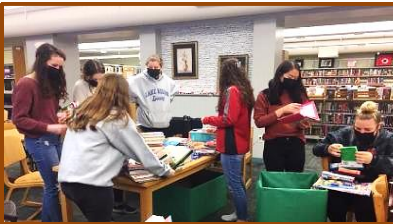
Dividing the collection of gently used toys & books.