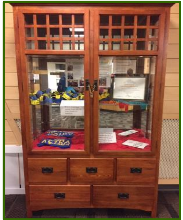
The impressive ASTRA cabinet in the front lobby of LRHS and some details of the items in it.