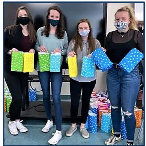
ASTRA completed a 2nd round of "Activity Bags" in time for April school vacation for the elementary students.