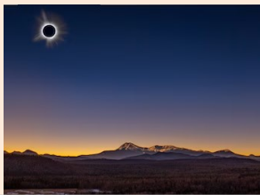
Total Solar Eclipse as seen from Mount Katahdin, Millinocket, Maine.