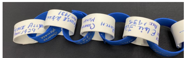
Our Chain of Service was increased by 3 links, this night. This chain was started in 1929. And now it's length spans 2 1/2 large folding tables.