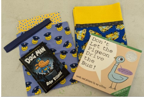
Pillowcase fabric matched to books

February 10 - Altrusans with Cricket Comforts members matching books to pillowcases.